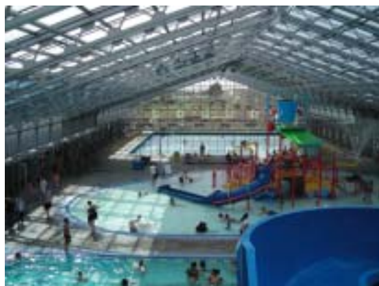
One vision for a pool complex (Lompoc)

The United Pools Council (UPC) and Pools for Berkeley (PFB) are citizen-driven, community-based initiatives to proactively address the needs of Berkeley in the areas of public swimming and aquatics recreation. Our primary objective has been to engage and focus the community – including swimmers, non-swimmers, Berkeley schools and parent associations, City officials, non-profits, and others – to examine, discuss, plan, and act upon the issues facing Berkeley pools in order to ensure more sustainable, long-term solutions.