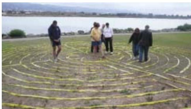
Future site of the labyrinth at the Marina