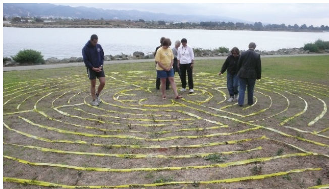
Future site of the labyrinth at the Marina