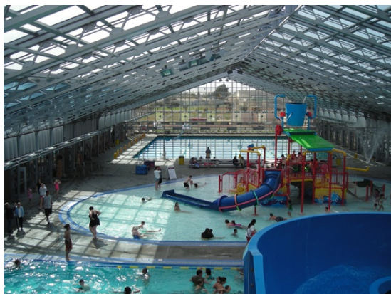
One vision for a pool complex (Lompoc)

The United Pools Council (UPC) and Pools for Berkeley (PFB) are citizen-driven, community-based initiatives to proactively address the needs of Berkeley in the areas of public swimming and aquatics recreation. Our primary objective has been to engage and focus the community – including swimmers, non-swimmers, Berkeley schools and parent associations, City officials, non-profits, and others – to examine, discuss, plan, and act upon the issues facing Berkeley pools in order to ensure more sustainable, long-term solutions.